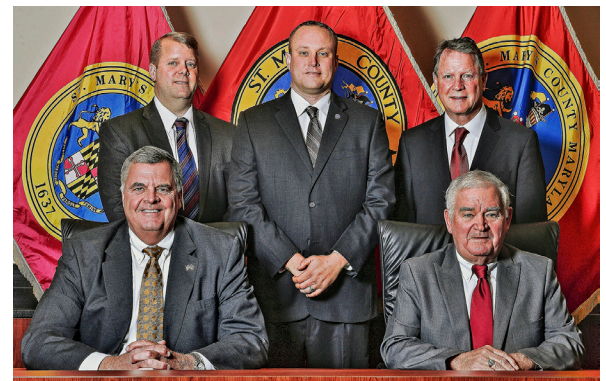
Commissioners of St. Mary's County